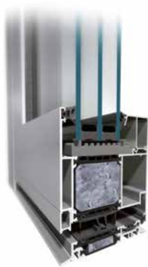
MB-104 Passive SI