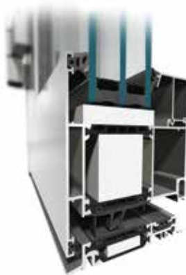
MB-104 Passive Aero