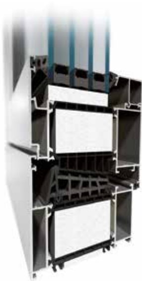
MB-104 Passive Aero