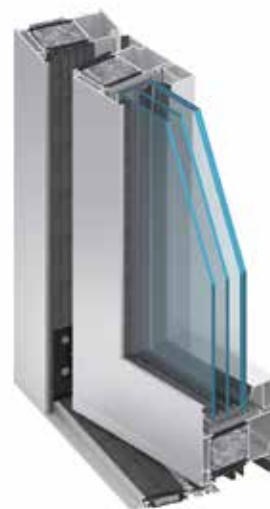
MB-104 Passive SI, RC3

Examples of heat transfer coefficients U_D